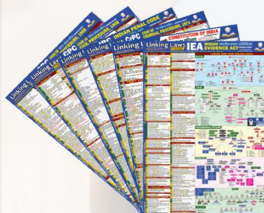
Major Laws Linking Chart