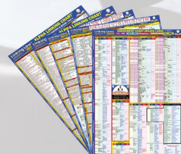
Alpha Minor Amendment Linking Chart