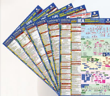
Major Laws Linking Chart