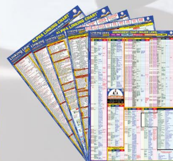
Alpha Minor Amendment Linking Chart