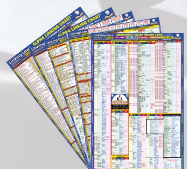
Alpha Minor Amendment Linking Chart