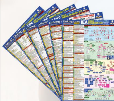
Major Laws Linking Chart