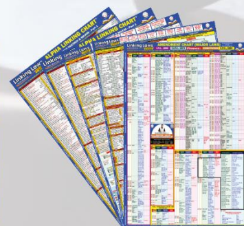
Alpha Minor Amendment Linking Chart