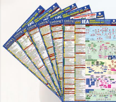
Major Laws Linking Chart