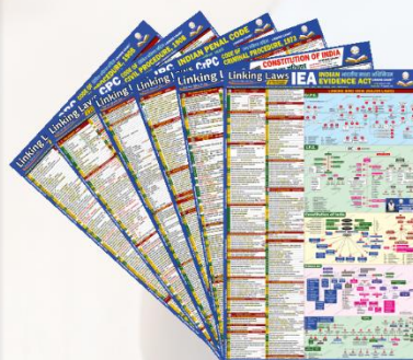
Major Laws Linking Chart