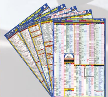
Alpha Minor Amendment Linking Chart